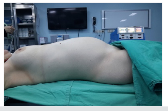
Figure 3. a, b: Surface appearance of the removed adnexa

Table 4 · Decker cratics recovery and complications (2)