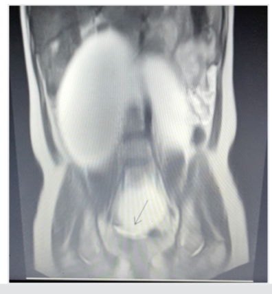
Figure 2 : Suspected relationship with right ovary in magnetic resonance imaging (marked with arrow)

the arcus costa in the right midclavicular line, on the line of the umbilicus in the left lower quadrant and left iliac wing in the midline, and between the umbilicus and pubis. With the help of the Verres needle, approximately 6.5 liters of mucinous cystic content was evacuated. Then, the entrance of the verres needle was closed by holding with a grasper. No escape of cystic content into the abdomen occurred. It was observed that the mass originated from right adnexa. The right adnexectomy was performed with the help of Ligasure<sup>™</sup> (Covidien-Medtronic). The piece was removed by expanding the 11-mm trocar site 11 mm trocar without using endobag (Figures 4 and 5). Then, intraabdominal