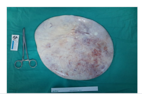
Figure 4: Epithelium lining the ovarian cyst lumen (arrow) (HE X 50)