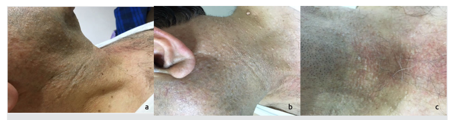
Figure 1a-c. Numerous common, whitish, dome-shaped papules of several millimeters in diameter in the neck

The risk of renal tumor increases 16-fold and the risk of spontaneous pneumothorax increases 50-fold in patients with Birt-Hogg-Dube syndrome in comparison to healthy population. Pneumothorax is probably associated with lung cysts (6). While the risk of renal tumor increases in advanced age and male gender, the risk of spontaneous pneumothorax decreases