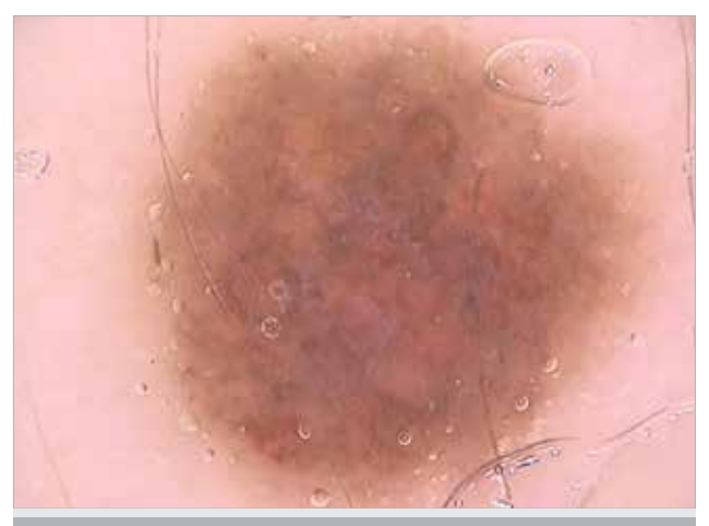
Figure 1. (Patient 1: first lesion) Negative pigment network and some blue-gray areas in favor of regression on erythematous background, some peripheral pigmentary globules

Meyerson postulated pityriasis rosea as the cause of eruption, but it is unclear. Some other triggering factors were suggested as ultraviolet radiation, chemotherapy, alpha-2B interferon therapy for HCV and Behçet's disease (2, 6).