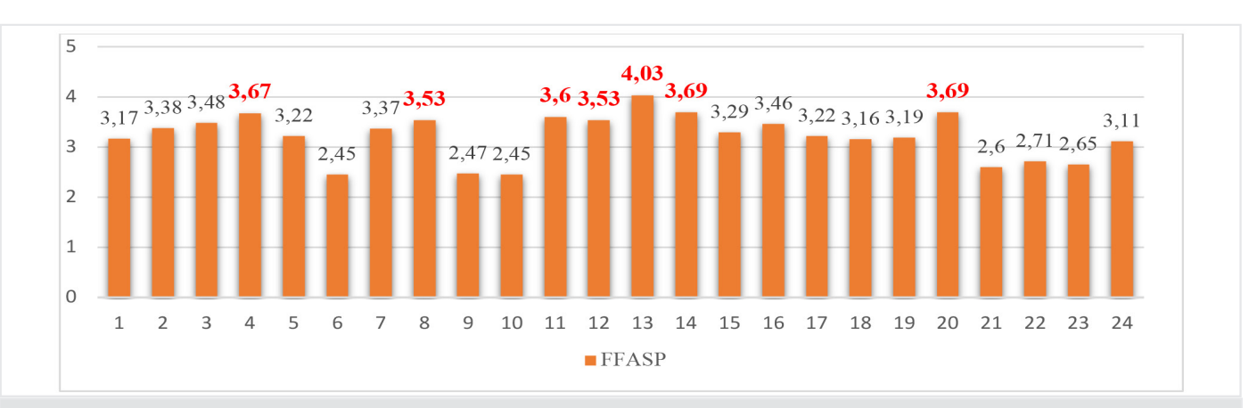
Figure 2. Distribution of factors affecting sleep patterns of women

1. The bed is uncomfortable, 2. The pillow is uncomfortable, 3. Bedding is dirty and uneven, 4. The room is airless, 5. There is much light in the room, 6. The room is dark, 7. The temperature of the room is inappropriate, 8. The room is crowded, 9. Being alone in the room, 10. Having a companion beside her, 11. Entering and exiting the room frequently, 12. Interventions made during sleep time, 13. Having pain, 14. Medical devices fitted to the body, 15. Being hungry or satiated, 16. Having concerns about the disease, 17. Not having enough information about the disease, 18. Thinking of home or work, 19. Not feeling safe, 20. Noise in the surrounding area, 21. Inability to exercise and sport, 22. No activity to do during the day, 23. Inability to apply pre-sleep habits, 24. Hours of sleeping and waking up in the hospital.