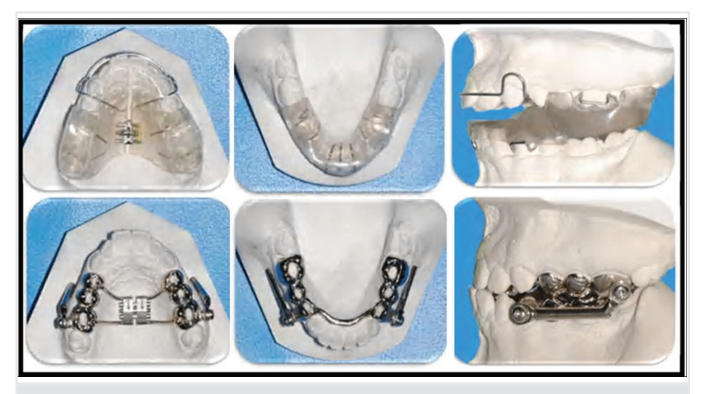
Figure 1. Crown Herbst and TWB appliance design used in this study

All patients had the following properties: (1) Class II malocclusion (2) treated with standardised Crown Herbst or TWB appliances,