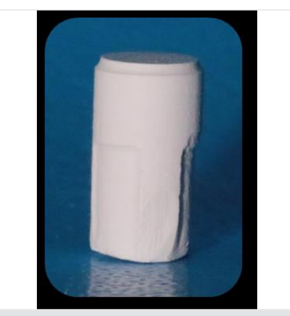
Figure 1. Side view of zirconia sample produced with CAM

The zirconia structures used in the study were obtained from pre-sintered Katana zirconia blocks (Kuraray Noritake Inc., Kurashiki, Japan). The dimensions of the zirconia samples were designed to be 3 mm in diameter and 6 mm in length after sintering. Designs were prepared using DWOS<sup>®</sup> (Dental Wings Open System) computer-aided design (CAD) software. Eighty samples were designed and produced by using computer aided manufacturing (CAM) (CAM Yenadent DC40, Yenadent Ltd., Istanbul, Turkey) (Figure 1, 2). Since the zirconia structures showed 20% shrinkage linearly after the sintering process, the samples were designed at this rate than the specified dimensions. Afterwards, it was sintered at 1500 °C for 2 hours in the sintering furnace (Programat CS4, Ivoclar Vivadent, Germany) in line with the manufacturer's recommendations.