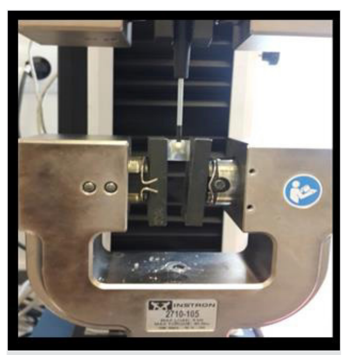
Figure 3. Instron universal test device and a sample put into the device

Statistical Package for Social Sciences (SPSS Inc., Chicago, IL, USA) Windows 16.0 program was used for the statistical analysis of the data. The mean, standard deviation, minimum and