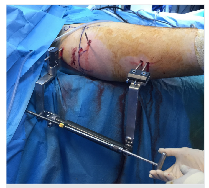
Figure 3. After the Schanz screw insertion and EF setup, the distractor was rotated in a counter-clockwise direction to achieve joint distraction using its T-handle EF: External fixator