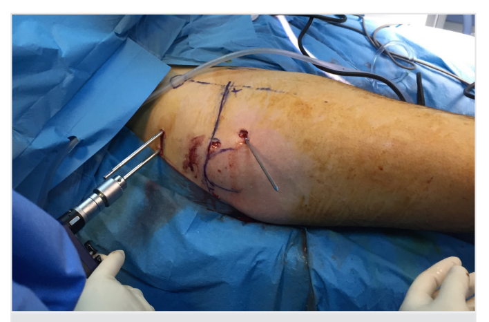
Figure 2. Application of the proximal Schanz screws to the supra acetabular region

The Harris Hip Score (HHS) and the Western Ontario and McMaster Universities Index (WOMAC) scores were evaluated