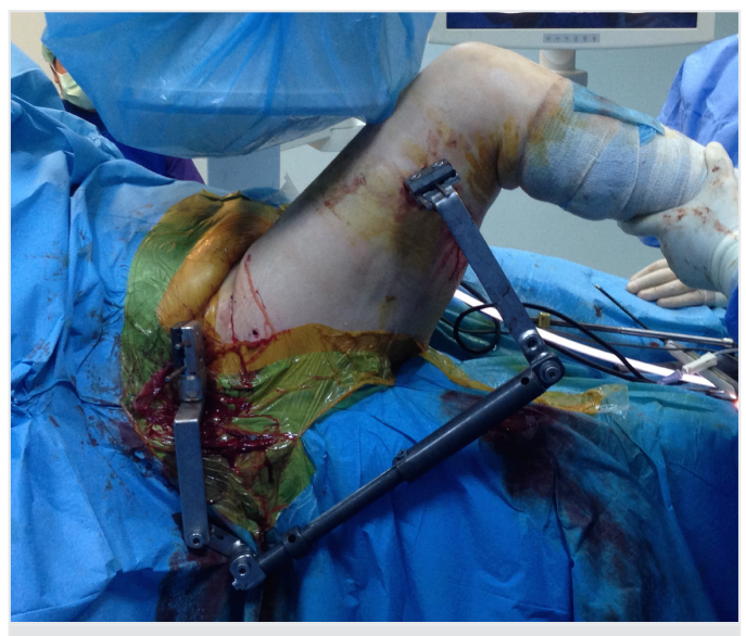
Figure 5. The novel EF allows up to 60 degrees of hip flexion as required EF: External fixator

All statistical analysis was performed using the Statistical Package for the Social Sciences statistical software package (IBM Corp. Released 2012. IBM SPSS Statistics for Windows, Version 21.0. Armonk, NY: IBM Corp.). The Shapiro-Wilk test was used to determine the concordance of the continuous data to normal distribution. Continuous data were presented as median (minimum-maximum) and mean \pm standard deviation values. Preoperative and postoperative functional results were statistically compared using the paired t-test. Results were reported as 95% confidence intervals and related p-values, wherein p<0.05 was considered statistically significant.