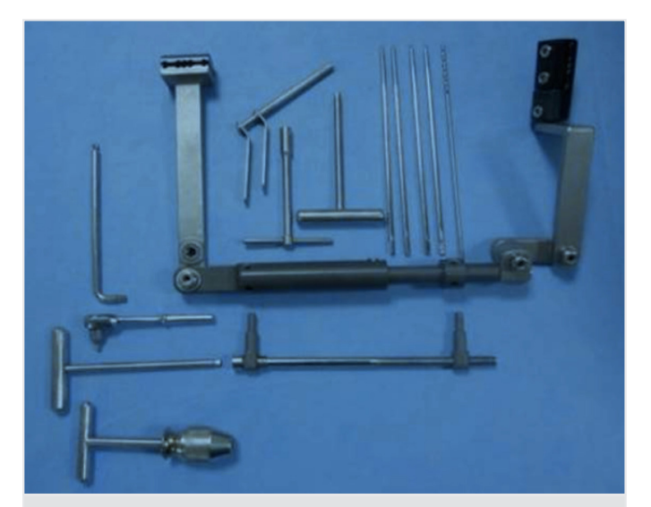
Figure 1. The novel designed EF, its distractor, half-pins, and other instruments for the set-up EF: External fixator

The outcome parameters include the required time for EF application and adequate distraction and the amount of joint distraction. The distance between the most superolateral edge of the acetabulum and the femoral head was measured on the fluoroscopy images before and after the distraction in the same leg position. The radius of the 6 mm Schanz screws placed at the supra acetabular area was also measured on the fluoroscopy images and the rate of magnifier was found for each patient. The difference between the post- and preoperatively measured lengths was multiplied with the magnifier ratio and the corrected distraction value was found.