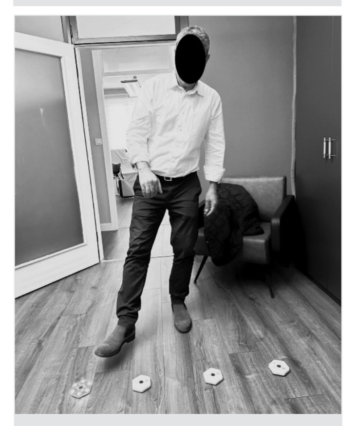
Figure 2. Reaction time exercises for the lower extremities with a Light Trainer Flash Light Exercise System

The sociodemographic and medical characteristics of 40 participants included in the study are given in Table 1.