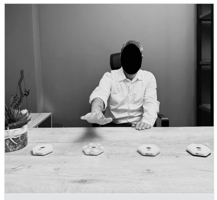
Figure 1. Reaction time exercises for the upper extremities with a Light Trainer Flash Light Exercise System

Initially, 43 participants volunteered for the study. The study was completed with 40 participants, excluding 2 participants who did not attend 3 consecutive sessions and 1 participant who did not attend 4 sessions in total (Figure 3).