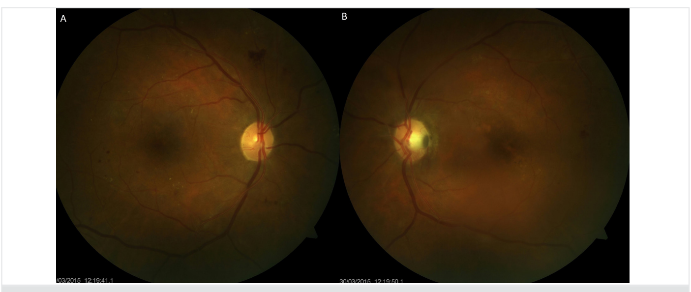
Figure 1. Fundus photographs of the patient's right (A) and left (B) eyes with diabetic retinopathy are shown. Neovascular vessels at peripapillary region and optic pit are seen in the left eye

The development of NV in DRP occurs as a result of the shift of the angiogenic/antiangiogenic factor balance in favor of angiogenesis. Angiogenesis is associated with the severity of